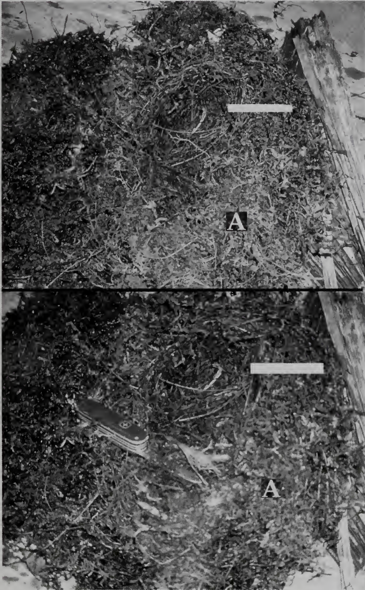
Figure 3. Cross-section of nest of Cranioleuca antisiensis , Mashpi Protected Forest, Pichincha, Ecuador, 8 March 2003. A = Roof of brood chamber (top). White bar indicates nest entrance (bottom). The roof of the brood chamber is covered by brown hairy Bombacaceae seeds (lower photo).